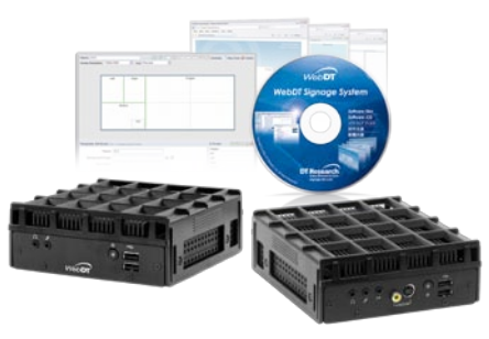
SA2000 and SA3000

Beijing Xingguang Film & TV Equipment Technologies