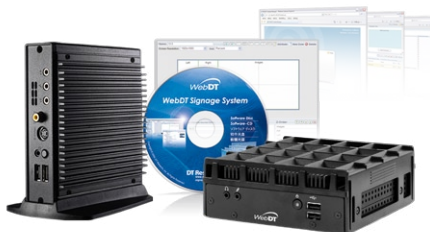
SA1000 and SA3000

Specialty's wanted a way to quickly change their menus from breakfast to lunch, using the same space. In newer locations, they are offering expanded seating areas, and they needed a way to promote their catering services and social marketing to customers. They also required remote management of the content and timing for the screens, so that their IT teams can control what is displayed and when without having to travel to each location. As part of a new food service law, they will also be required to present nutrition information on all items, a complex task with changing menus.